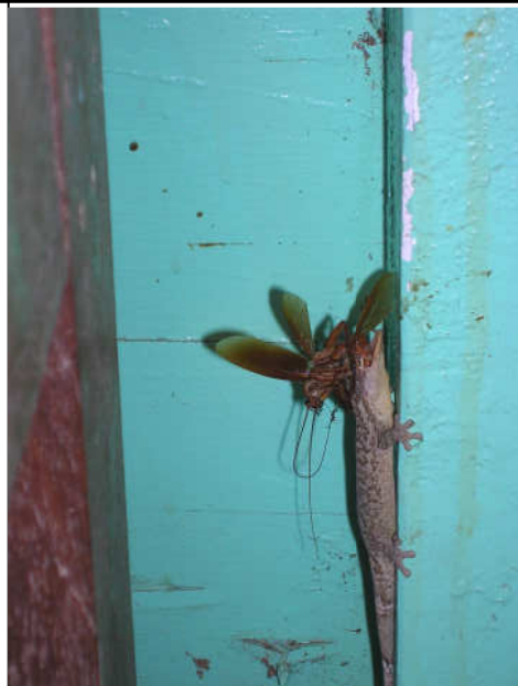
ONE OF OUR WELCOME HOUSE GUESTS

All contributions are tax deductible, Can. tax reg. number, BN 85432 2922 Cheques should be made out to Wings for Humanity Foundation Contributions can also be made through the Rutland SDA Church