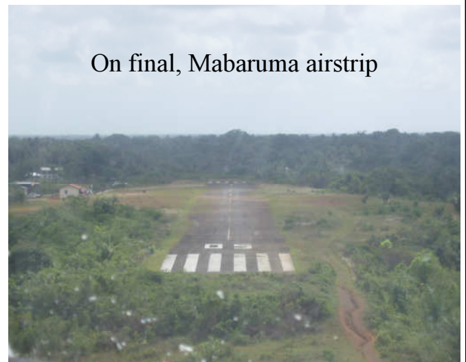
On final, Mabaruma airstrip