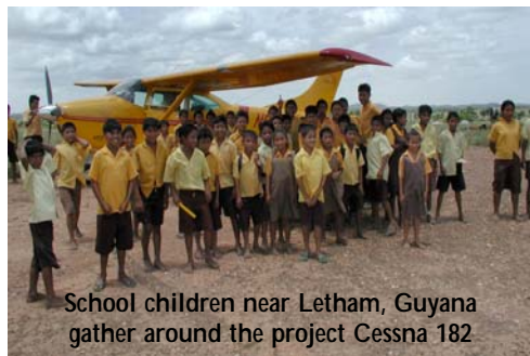
School children near Letham, Guyana gather around the project Cessna 182